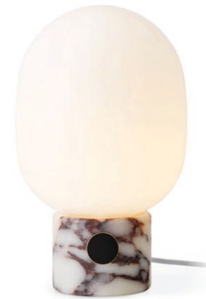
CALACATTA VIOLA MARBLE 1830319