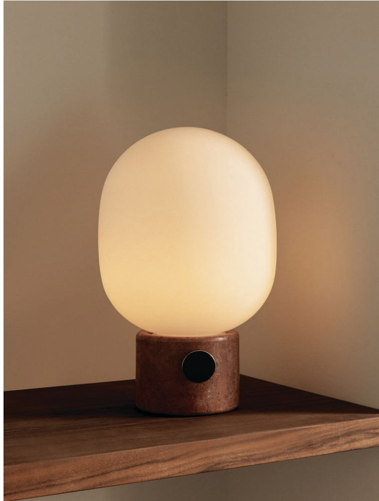
JWDA TABLE LAMP, MARBLE Designed by Jonas Wagell