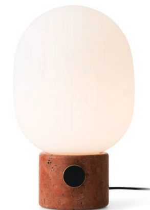
RED TRAVERTINE 1830329