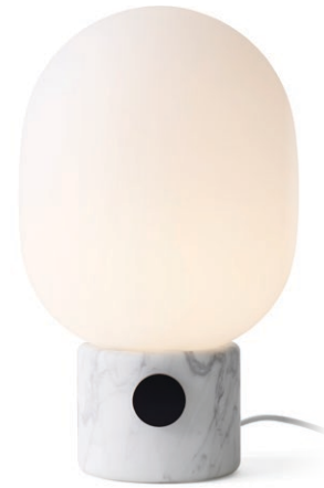
CARRARA MARBLE 1830639

Originally inspired by more archaic oil lamps of the past, the JWDA's form has been simplified into an organic shape that beautifully blends contrasting elements, whereby the raw and delicate harmoniously meet in one. Casting a muted, soft glow, JWDA comes supplied with a G9 frosted bulb, which can be easily adjusted by hand. Its simple silhouette and timeless quality will add a touch of sophistication to the interior, but its functionality and ease of use will ensure that JWDA will become an important part of people's daily lives and do more than just look good.